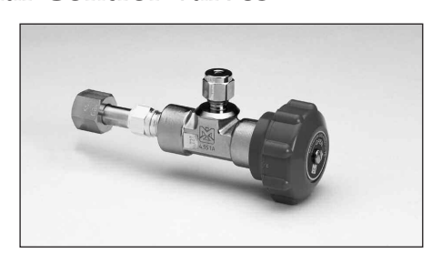
Model 4351 Series Diaphragm Valve