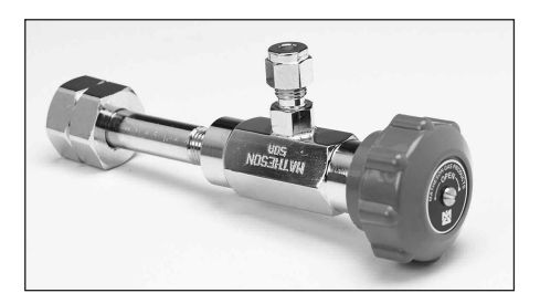
Model 50A and 61A Series Packed Stem Valve