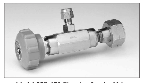
Model 55F-679 Fluorine Service Valve