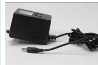
115 VAC Adapter/Battery Charger