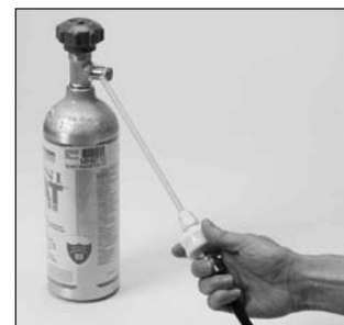
10" Hydrophobic Sensing Probe