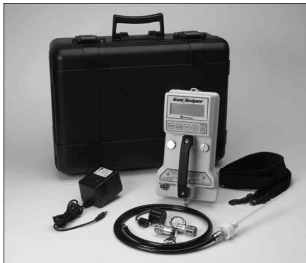
“Optional” carrying case shown with Gas Sniper accessories