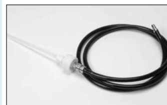
Polyurethane Sampling Hose (Hydrophobic Sensing Probe Separate)