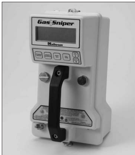
Gas Sniper-01 Model for EPA Method 21