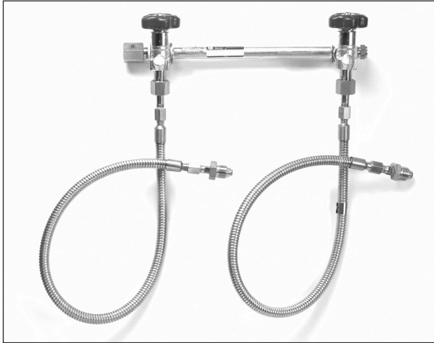
The SourceTrak™ Manifold System distributes gas safer and more efficiently.