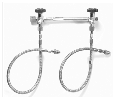
The SourceTrak™ Manifold System